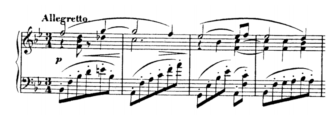
Chelsey Hamm. © 2020. CC BY-SA 4.0. Open Music Theory.

Recording: <u>https://www.youtube.com/watch?v=qIgQnOqMo1A</u> (0:00–0:07)