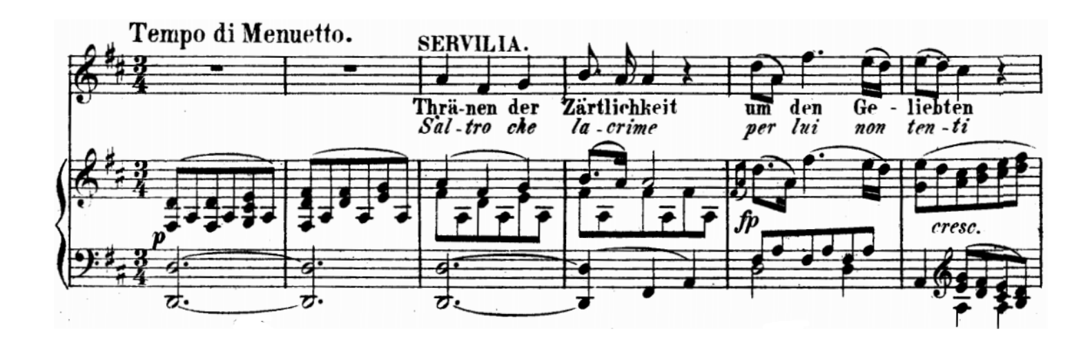
Excerpt 1: Mozart, "S'altro che lacrime" from La clemenza di Tito, mm. 3-10